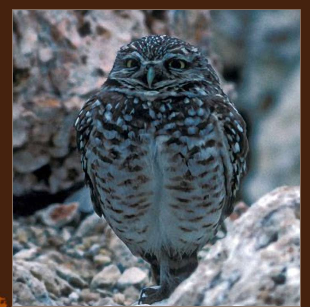
Burrowing Owl/Ted Lee Eubanks

Along the Byway, look for short-cropped grassy fields with scattered dirt mounds. These are signs of black-tailed prairie dog "towns." At The Nature Conservancy's Cheyenne Bottoms Preserve, burrowing owls nest in prairie dog holes, just one of many species to utilize the extensive tunnels.