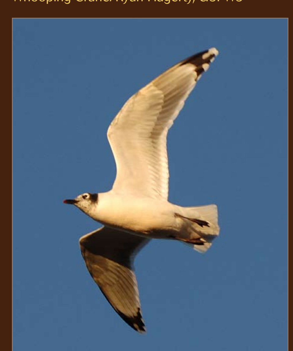
Franklin's Gull

In 1941, just 21 whooping cranes remained in the wild. By 2007, the population had rebounded to almost 350. Most migrate between Canada and the Gulf coast of Texas, and Byway wetlands are among the few places where you consistently see this majestic bird during migration.